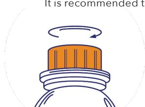
Step 1: Open the cap

It is recommended that Cavalor LaminAid be administered by syringe directly into the mouth.